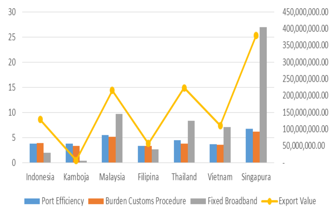
Figure-2. Average trade facilitation conditions and ASEAN export performance 2012–2016.

The Figure above shows the conditions of trade facilitation in ASEAN. As a whole, it seems that Singapore has a good export performance which is illustrated by the value of exports. The export performance is supported by a high trade facilitation index value, with a high percentage of fixed broadband usage. Whereas Cambodia shows a low export performance with a low quality of trade facilitation. Based on the Lpi (2016) Singapore State was ranked first in customs performance. Then according to the Wef (2016) Singapore is ranked second in the best port infrastructure and is supported by a high percentage of fixed broadband usage. Different from Singapore, Cambodia which is still ranked 77 for customs performance and 76 in the assessment of port infrastructure. While the rest, namely Malaysia, Thailand, Philippines, Indonesia, and Vietnam are still in the 30s and below.