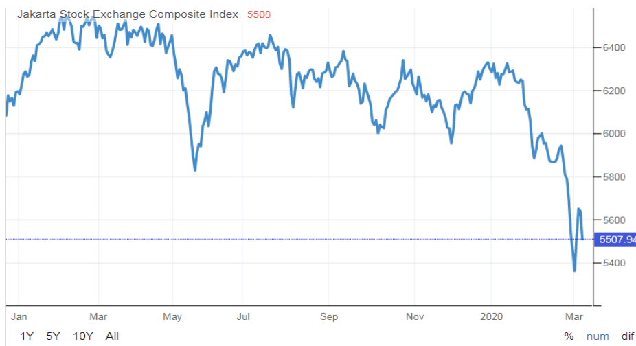
Figure-1. Performance of Indonesia stock exchange in the year of 2020.

The stock exchange in Indonesia was founded in 2007. In the recent times, there are 656 companies listed in this stock exchange. In the year of 2017, there were 628,346 domestic investors based on single identification number. While, in the year of 2019, there has been an increase of 30 percent in the number of total stock investors, and they are in number 1.1 million (Tempo.Co, 2020; Tribunbisnis, 2020). However, since the beginning of 2020, there is 12.49% decrease in the share market (Trading Economics, 2020).