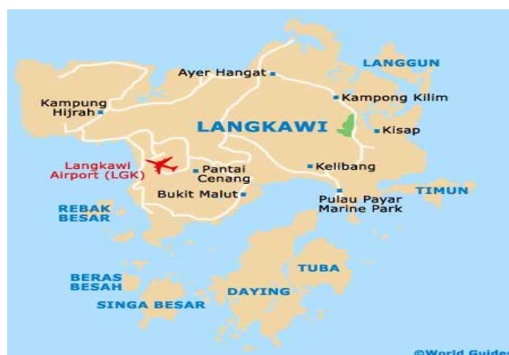
Figure 2. Langkawi map.