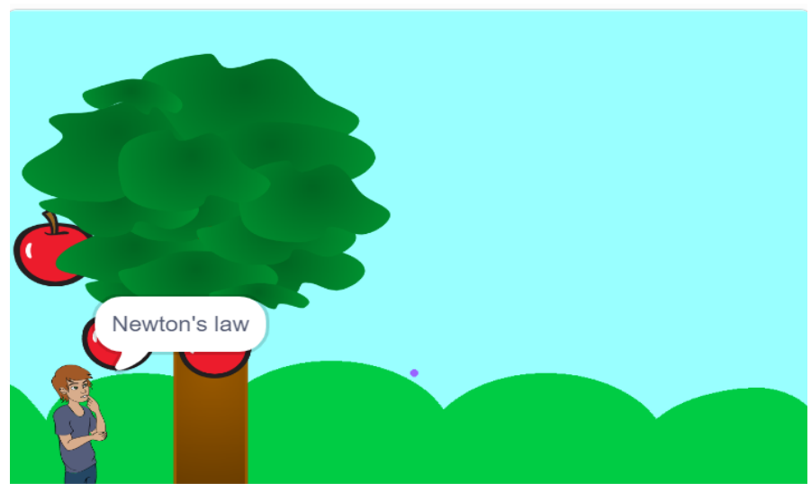
Figure 2. Screen shoot of physcis scratch project.

A sample of the physics project (newton law), the link is <a href="https://scratch.mit.edu/projects/631667157/">https://scratch.mit.edu/projects/631667157/</a>, and the screen shoot in Figure 2.