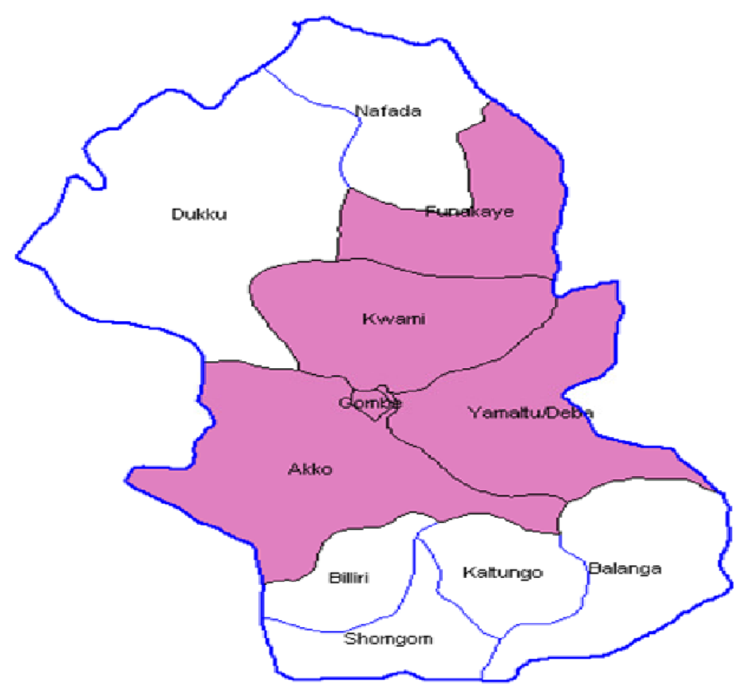
Figure-1. Map of Gombe State showing the eleven local government areas and the state capital.